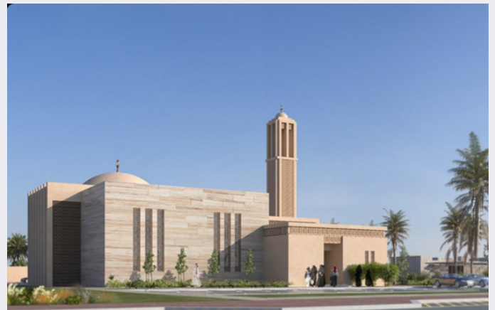
SEEF AL JUBAIL MOSQUE