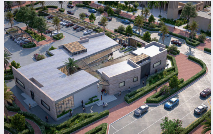
SEEF AL JUBAIL COMMUNITY CENTER