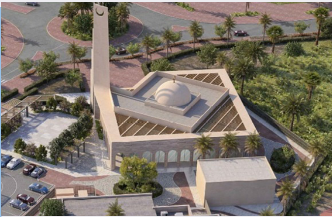
NAD ALDHABI MOSQUE