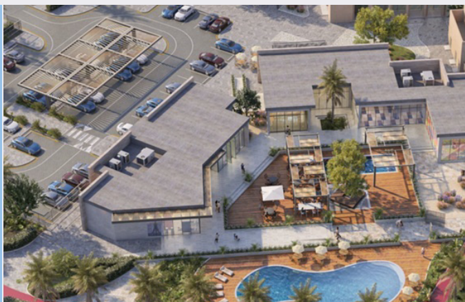
NAD AL DHABI COMMUNITY CENTER